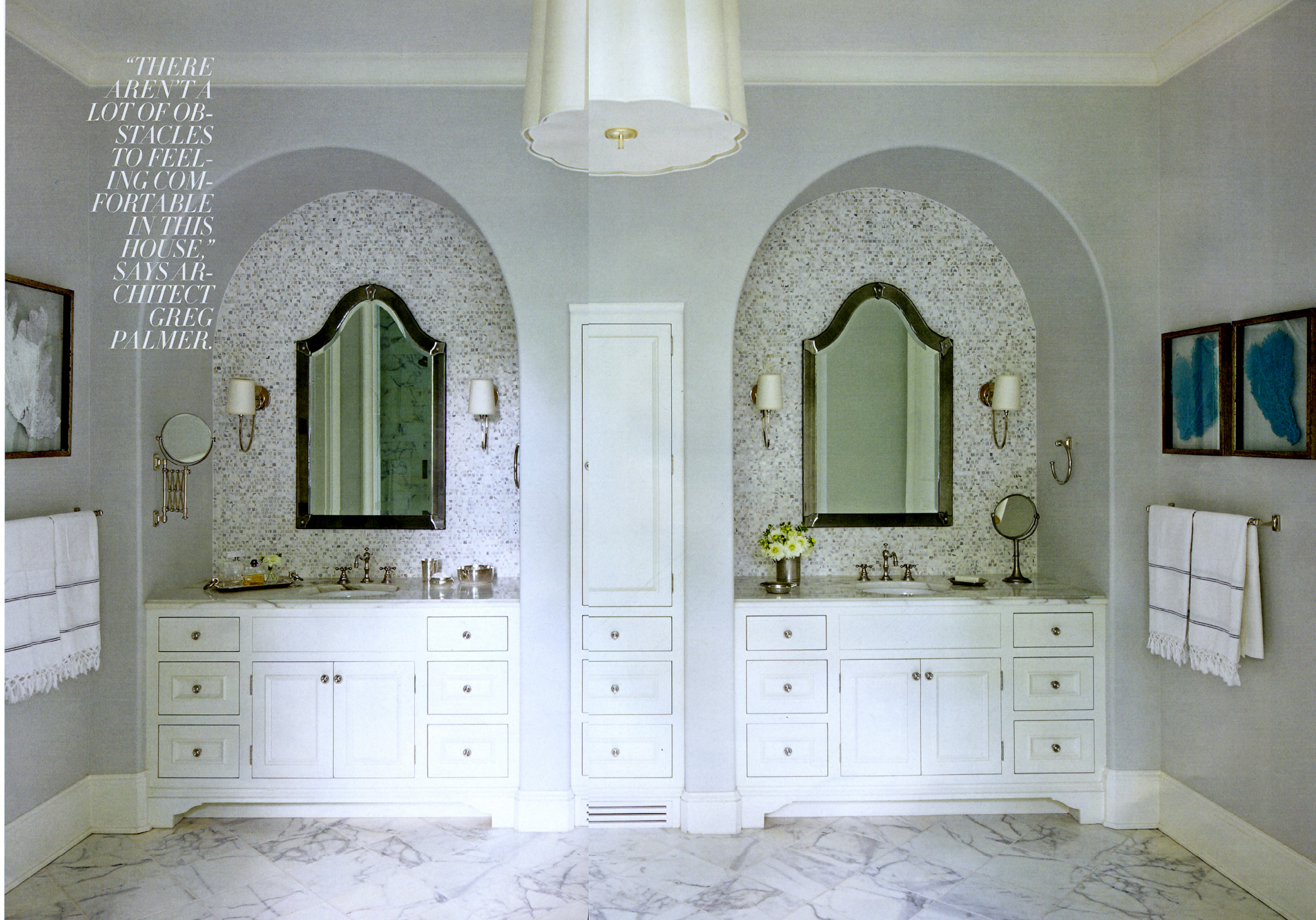
His-and-her alcoves in the master bedroom feature custom cabinetry by Block & Chisel and fixtures by Circa Lighting. The framed sea fans are by Max. & Co.