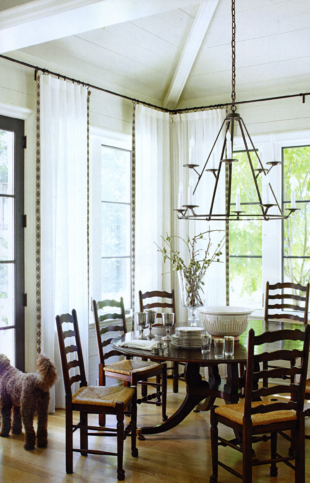
A Jerry Pair iron chandelier centers the vaulted ceiling in the window-wrapped breakfast nook. Dishes by Match and a Formations bowl from Jerry Pair top the family's heirloom table surrounded by Holland & Company chairs. right A lime-washed oak island anchors the sprawling whitewashed kitchen, lined in custom cabinetry by Block & Chisel and outfitted with Calcutta Gold countertops and an eye-catching reclaimed barn wood range hood.