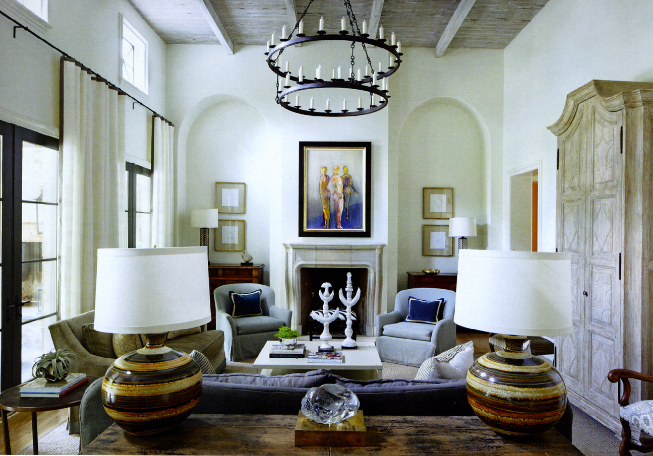
left The light-filled living room spills out onto the pool loggia. The twin chandeliers and lime-washed armoire are by Formations at Jerry Pair, the table lamps are from Parc Monceau and the artwork above the fireplace is by Kyle Schwartz. below left The cypress-paneled library creates a cozy recess with rich colors. Accent pillows with a hint of orange from Bungalow Classic pair perfectly with the family's navy sofa. The mirrors are from Max & Co. right Chevron flooring, grooved walls and a geometric pendant lamp in the entry hall establish an eclectic beat enhanced by a table lamp and accessories from Bungalow Classic.