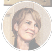
▲ HEATHER WELLS PAULLAC SINGLE SCONCE BY JONATHAN BROWNING, $369

Inspired by 1940s French lighting fixtures.