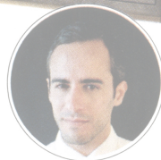
▲ ECHÉ MARTÍNEZ MACHINTO ARMOIRE, $3,995

"The perfect intersection of warm, impeccable craftsmanship and clean-lined simplicity. I see this as a statement in an entry foyer, setting the tone for the rest of the house."