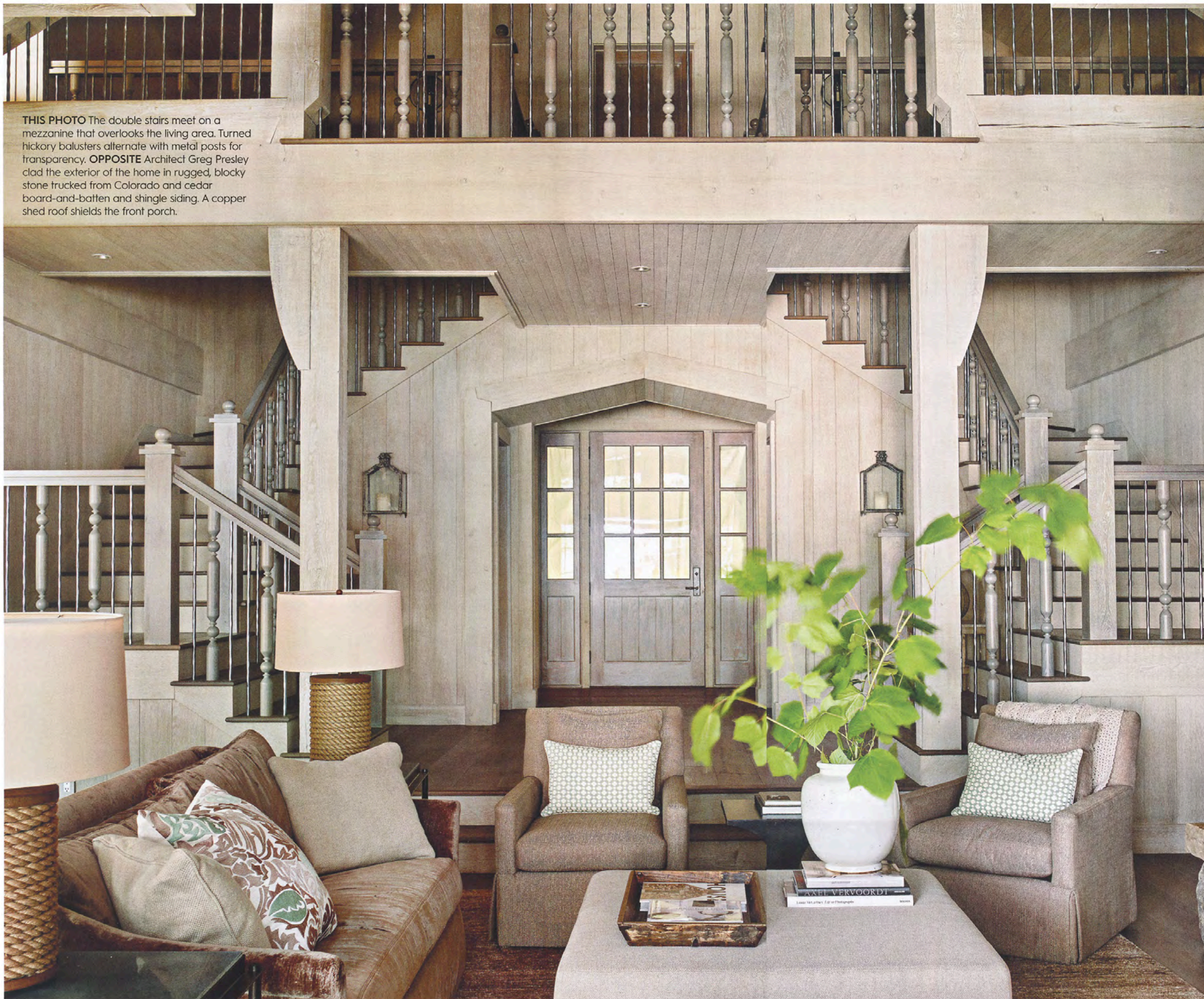
THIS PHOTO The double stairs meet on a mezzanine that overlooks the living area. Turned hickory balusters alternate with metal posts for transparency. OPPOSITE Architect Greg Presley clad the exterior of the home in rugged, blocky stone trucked from Colorado and cedar board-and-batten and shingle siding. A copper shed roof shields the front porch.