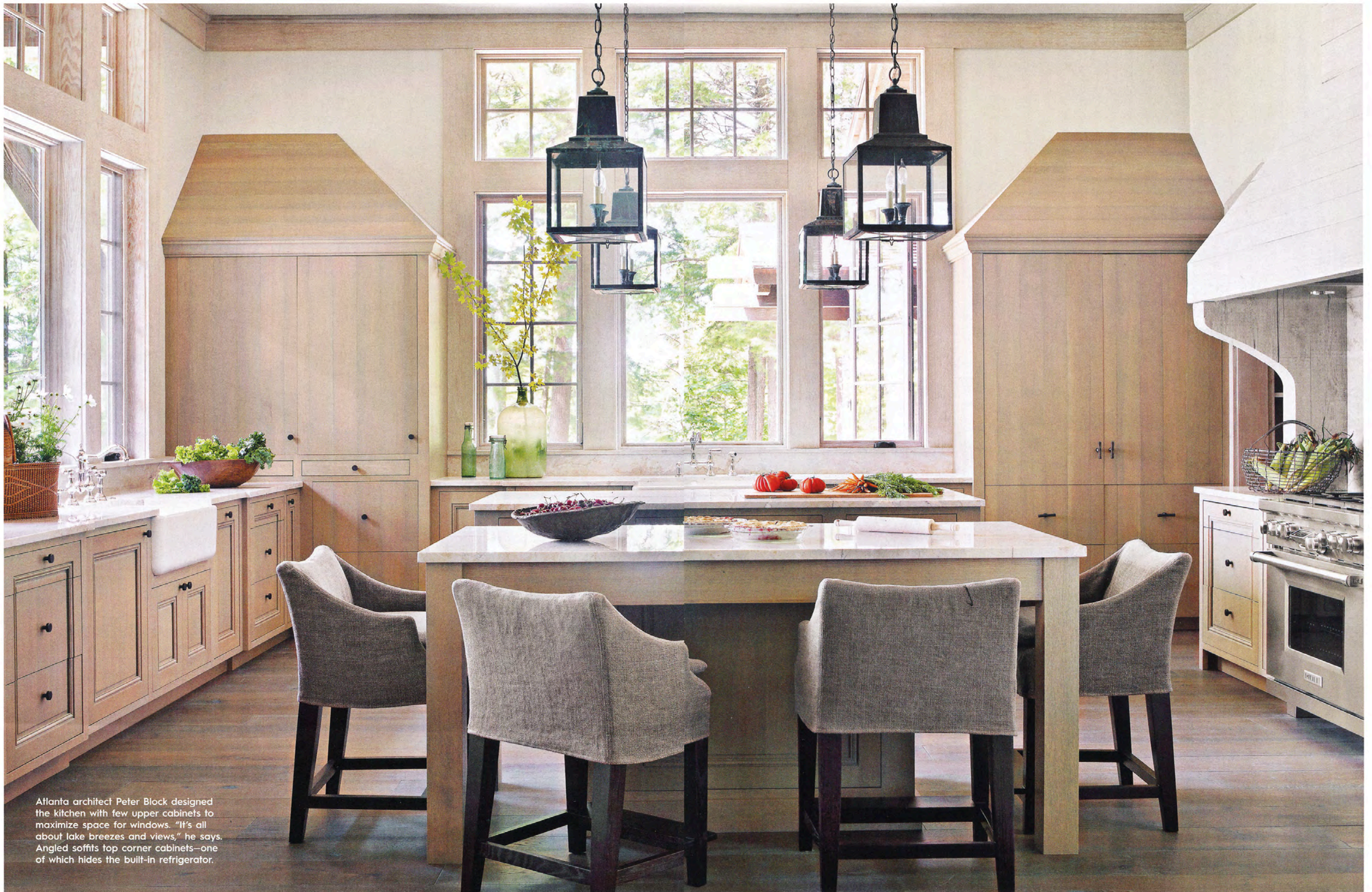
Atlanta architect Peter Block designed the kitchen with few upper cabinets to maximize space for windows. "It's all about lake breezes and views," he says. Angled soffits top corner cabinets—one of which hides the built-in refrigerator.