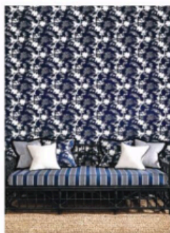
Clockwise from top left: Chairs upholstered in Aurora fabric, Roche wallpaper. De la Tour fabric. Beijing Blossom wallpaper and pillows; Zelda Stripe on bench cushion. Bamboo Cane fabric and wallpaper.