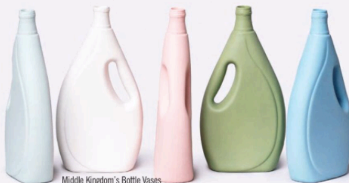
Middle Kingdom's Bottle Vases